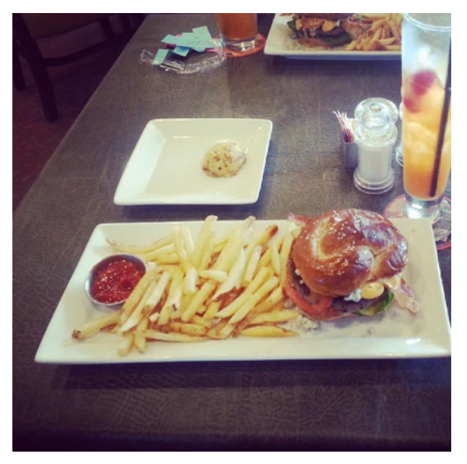
User: #foodie, #hungry, #yummy, #burger

<u>Machine</u>: #burger, #chicken, #fries, #chips, #ketchup, #milkshake