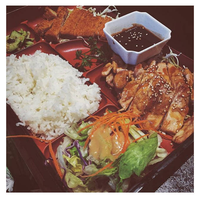
<u>User</u>: #pork, #foodie, #japanese, #chicken, #katsu, #box, #salad, #restaurant, #bento, #rice, #teriyaki

The rest of the paper is structured as follows. In the next section we review work related to (i) the perception of food and its relationship to health, (ii) using social media for public health surveillance, and (iii) image recognition and automated food detection. Section 3 describes the collection and preprocessing of our Instagram datasets, including both our large dataset of 1.9M images used to analyze food perception gap and its relation to health, as well as even larger dataset of \sim 3.7M images used to train and compare our food-specific image tagging models against the Food-101 benchmark. Section 4 outlines the architecture we used for training our food recognition system and shows that it outperforms all reported results on the reference benchmark. Our main contribution lies in Section 5 where we describe how we compute and use the "perception gap". Our quantitative results, in the form of indicative gap examples, are presented in Section 6. In Section 7 we discuss limitations, extensions and implications of our work, before concluding the paper.